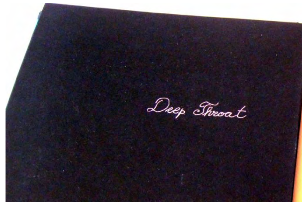
Deep Throat (25,5 cm X20,5 cm).

Multiple flag books followed. These are more complicated to do. It is all in the planning and gluing and there is no margin for mistakes. These books open with a wonderful soft flapping sound.