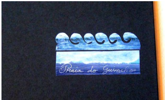
Praia do Guincho, (26 X 21 cm).